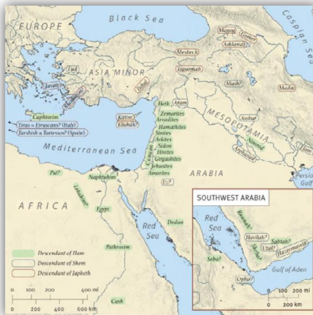
Table of Nations (67)